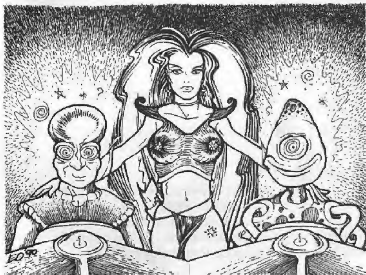
"Syreen with Hypnotized Crew"